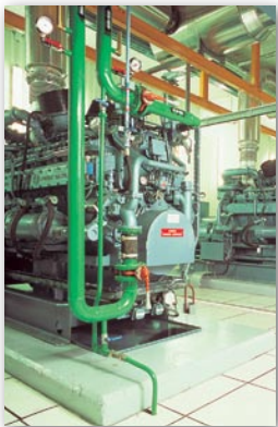
Percent Flow, HP, Pressure